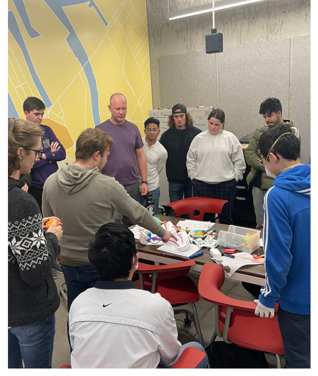
Students are challenged to prototype not the product of their capstone, but the process of their teamwork

Our first cohort of 17 new mechanical engineering students are now in their senior year and as