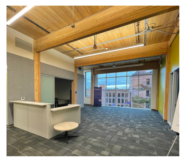
The welcoming entry to the Global Innovation and Design Lab. Watch for our Open Houses!