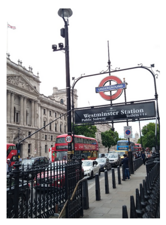
London, United Kingdom, Summer 2022

Overall, my study abroad journey focused on learning by experiencing other lifestyles. It gave me a lot of real-life examples to many written theories I learned in lecture classes. Also, the experiences inspired me with a lot of potential research ideas that I could use for my future projects. I recommend other students to study abroad and gain better insights!