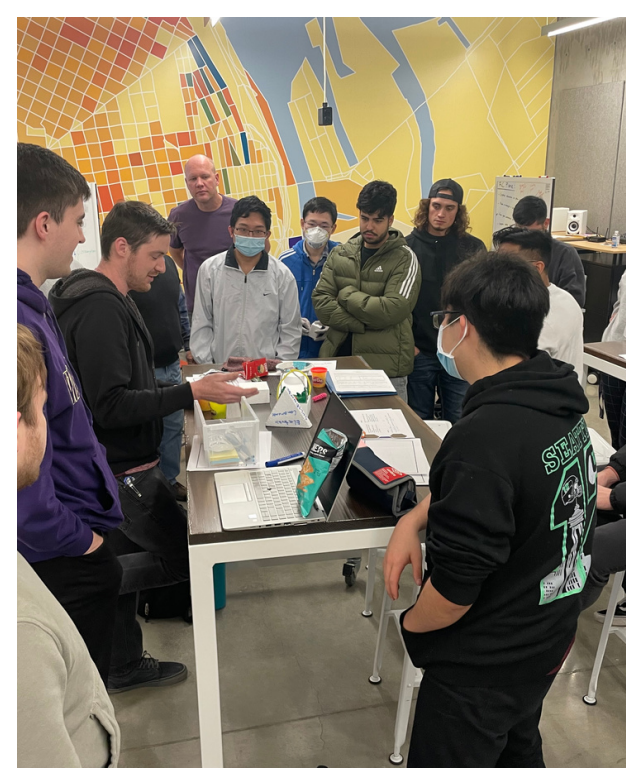
Models depicted unifying values of collaboration, empathy, and accountability