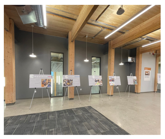
Generous hallways open up spaces to showcase student research and spark collaborations